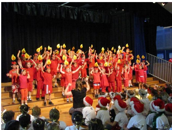
K-2 students performing

A list of major award recipients can be found as an insert.